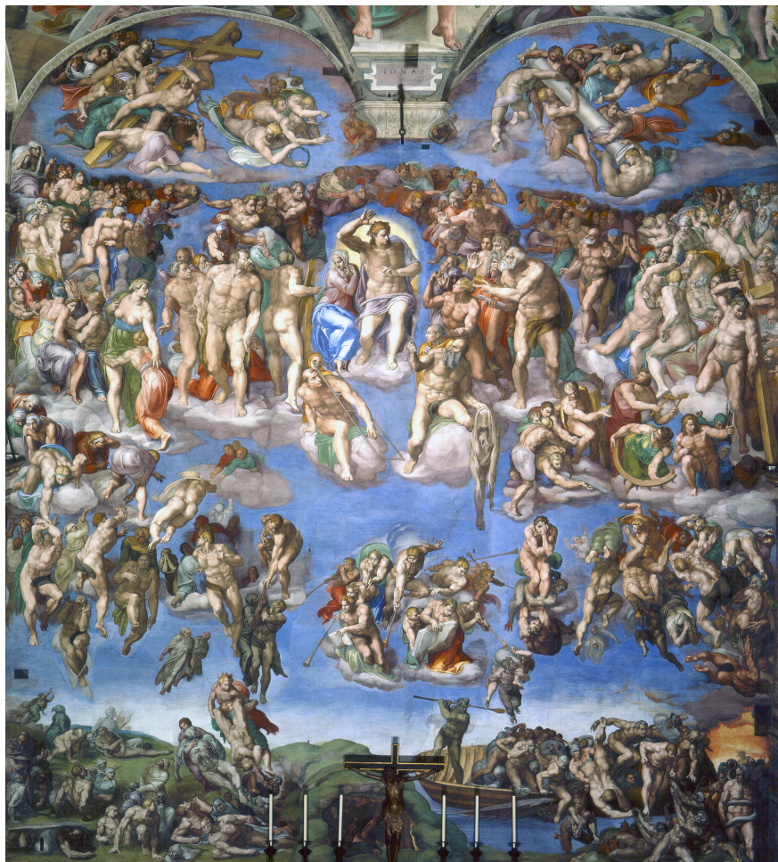
The Last Judgment by Michelangelo (1541) in the Sistine Chapel, Rome

Psalm: I rejoiced when I heard them say: "Let us go to God's house."