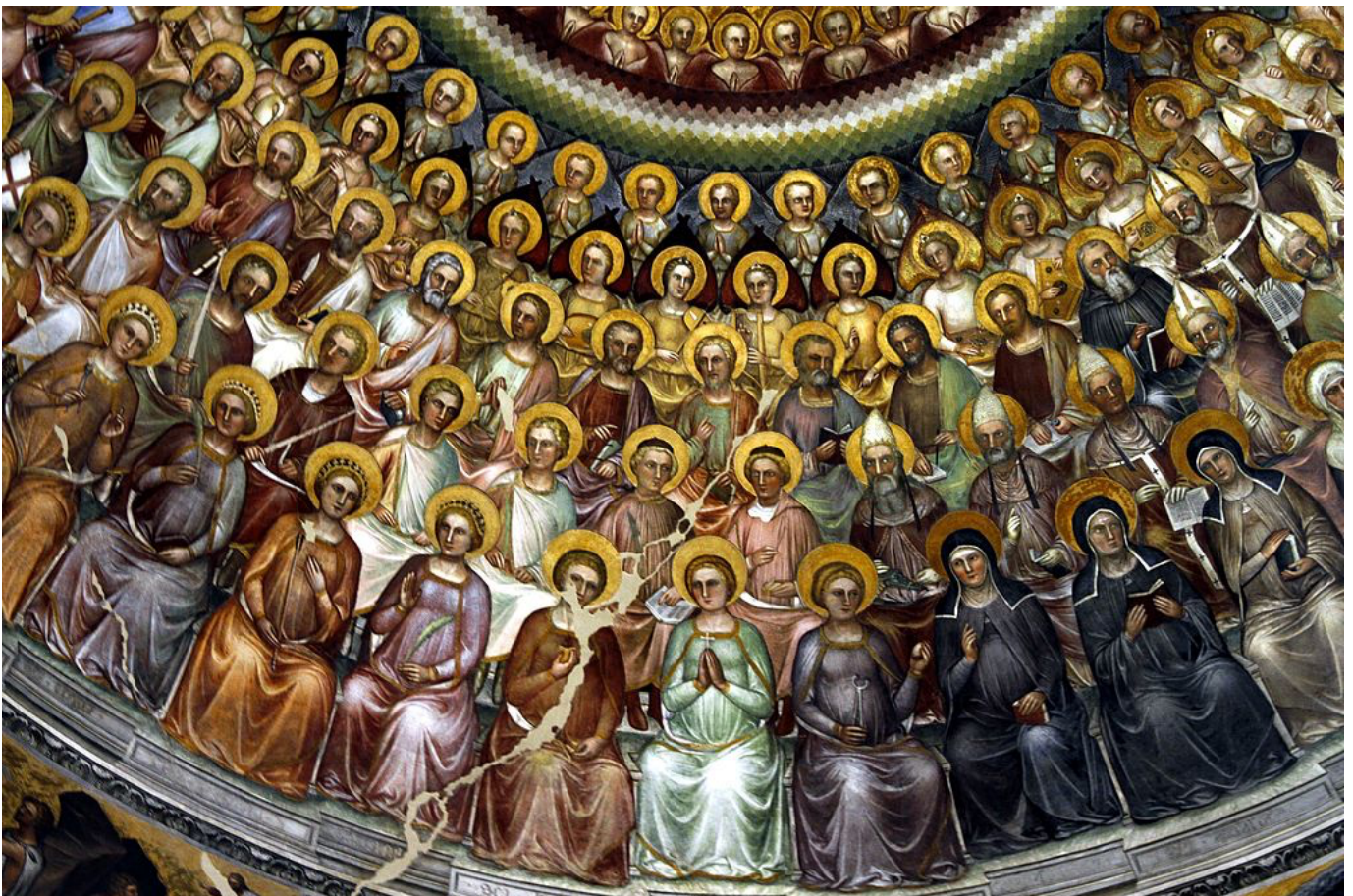
Communion of saints in the Baptistry - Padua

Psalm: I shall be filled, when I awake, with the sight of your glory, O Lord